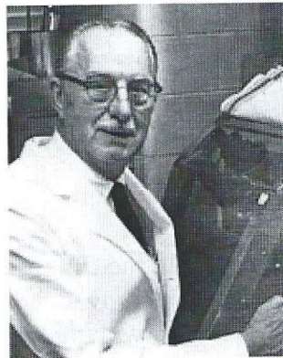
The day George Gey got his hands on Lacks's cells, everything changed.